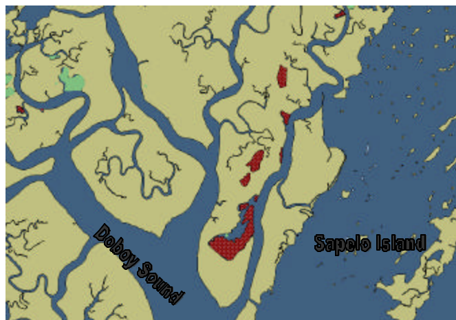
Figure 1. Back-barrier islands sampled in McIntosh County, GA are indicated by shading.

We conducted a series of field observations within and near the Georgia Coastal Ecosystems Long Term Ecological Research (GCE LTER) site at Sapelo Island, Georgia, during the summer and fall of 2002 (Fig 1). The back-barrier islands were selected on the basis of accessibility, minimal impact from residential or agricultural development, natural origin (as opposed to dredge spoil) and size. Back-barrier islands were identified using an ESRI ArcView v.3.2 map database provided by the Georgia Dept. of Natural Resources